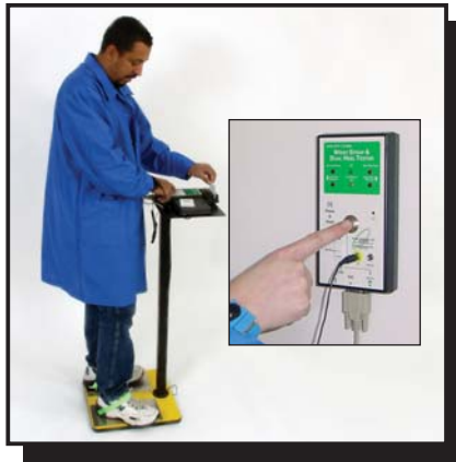
Attach wrist strap, step on dual plate and press metal button.