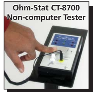
Adjustable limits. Test each foot and wrist individually and simultaneously

When used with a computer and leading edge software the employee's test results are stored in the computer and then can be emailed to supervisors. NO MORE LOG BOOKS. These reports and data can help conform your company to 20/20 specifications or ISO conformance. Speed up testing, and eliminate no tests.